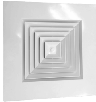
BORDERED HT-2X2-BSPL BOOT DIAMETER OPTIONS