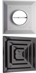
3 CONE HT-2X2-SPL BOOT DIAMETER OPTIONS