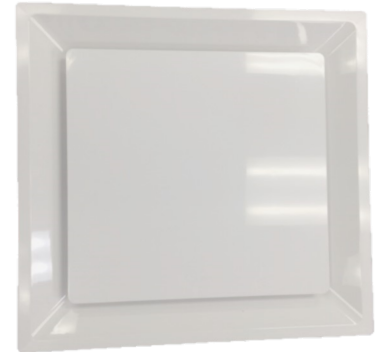
PLAQUE HT-2X2-PSPL BOOT DIAMETER OPTIONS